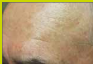
Actual Patient: 72 year old male, 5 SkinPen procedures. AFTER picture was taken 9 months after 5th procedure.